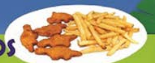
CHICKEN NUGGETS CON PAPAS Y JUGO .... FISH STICKS CON PAPAS Y JUGO ....