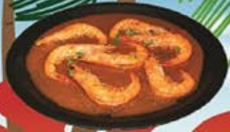
CAMARONES CUCARACHAS (shrimp cooked in special house sauce) 1 dozen ..... 1/2 dozen .....