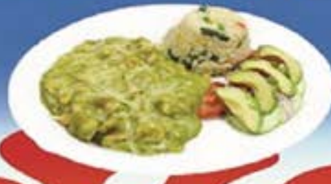
CAMARONES CULICHIS .... (shrimp cooked in cream sauce served with rice, salad and tortillas)