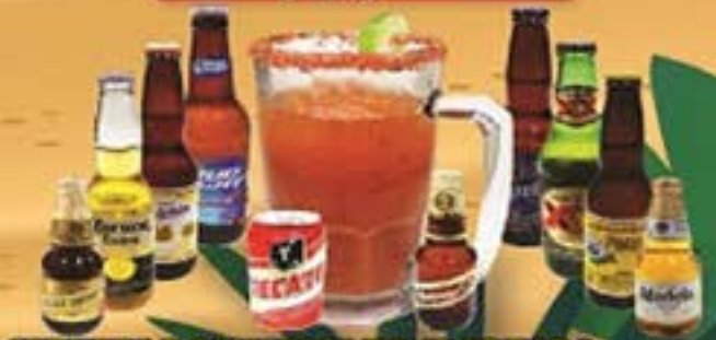
CERVEZA DOMESTICA E IMPORTADA MICHELADA