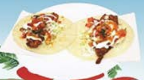
TACOS DE PESCADO .... (fish tacos)