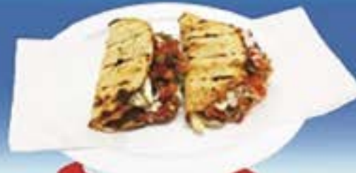
TACOS DE MARLIN .... (marlin tacos)