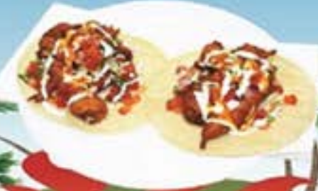
TACOS DE CAMARON .... (shrimp tacos)