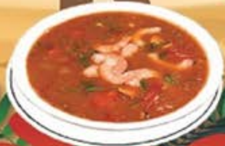
CALDO DE MARISCOS .... (hot seafood soup with shrimp, octopus, abalone & fish)