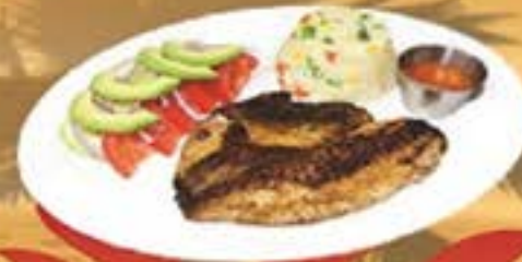
PESCADO A LA PLANCHA .... (grilled fillet of fish served with rice, salad & tortillas)