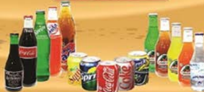
SODAS DE BOTELLA MEXICANA ....