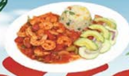
CAMARONES ENCIJILADOS .... (spicy shrimp served with rice, salad and tortillas)